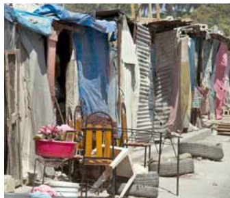
Health care workers fear cholera will spread further in squalid camps where some 1 million Haitians still live 10 months after the earthquake.

Please consider giving an online gift today for the Haiti Cholera Outbreak Relief Fund by going to our Web site at www.gloriadeionline.com and clicking on Relief Fund or call 888-843-5267.